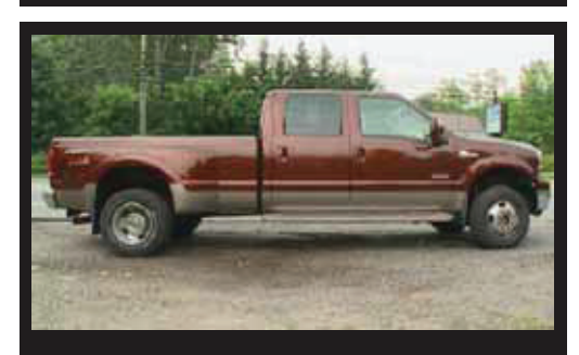
This truck was featured in the ABC News story investigating the fraudulent sale of a Hurricane Sandy flood loss vehicle.

NSVRP also cautions that a majority of the vehicles involved in natural disasters are not covered by property/casualty insurance either due to the age of the vehicle, or as a result of being part of a self-insured fleet, or just as a result of a lack of such coverage based upon cost considerations. As a result, those flood loss cars would not be reported into VINCheck, even if all participating insurers fully reported into the system.