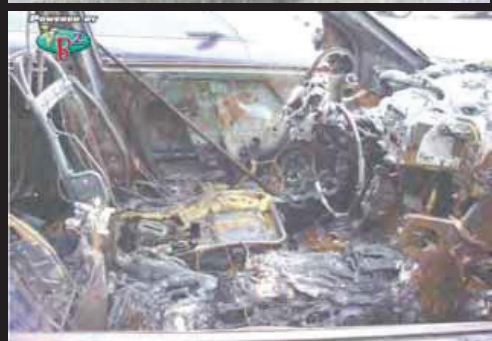
The insurer underestimated the damage of this obviously unrepairable 2004 Honda Pilot to avoid a non-repairable title designation. Today, a vehicle with the same VIN is registered in Michigan. It appears the original burnt-out but under-branded Pilot was purchased for the paperwork by what is now known to be an international organized crime group.